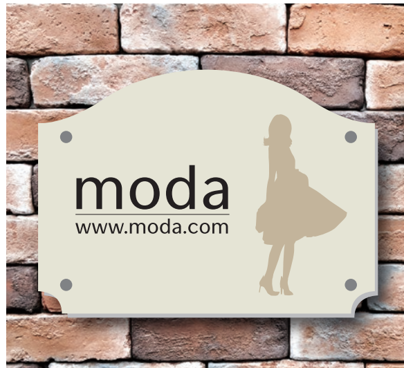
Shop name signs