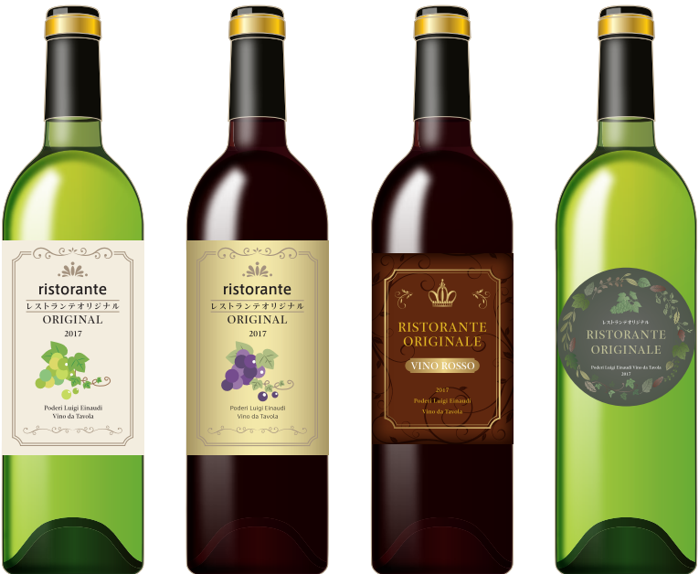
Original wine label AXIS Title / TP Mincho Title