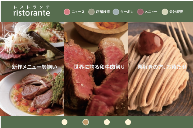
Website AXIS Title